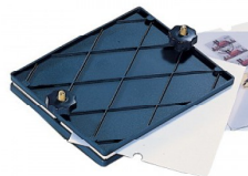
Manual Stamp Press

The manual press has knobs to tighten and press the stamps flat while they dry while the electric press has a heat element and blower to aid in the drying and flattening of the stamps. Manual press is about $50 and the Electric around $500