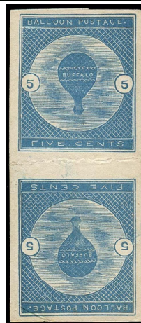
USA Scott #CL1a 1870 Balloon 5¢ Blue Semi Official Airmail, Tête-Bêche Pair

Tête-Bêche stamps are a pair of stamps where one stamp is printed upside-down in relation to its adjoining copy. The upside-down printing could be intentional or accidental. Some countries, such as France, have creat-